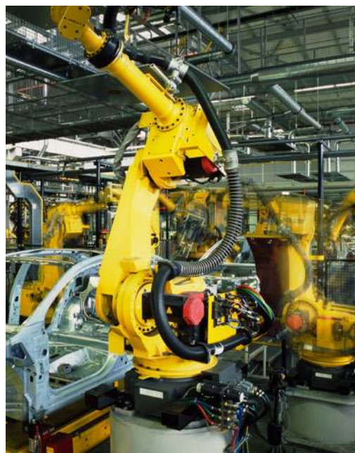
Figure 2 Krytox™ Performance Lubricants Product Range

Krytox™ lubricants provide OEMs with significant cost savings when specified for use during the design phase. By lengthening the life of critical components, Krytox™ lubricants reduce repair costs and potentially save millions in warranty claims.