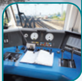
5 Driving cabin