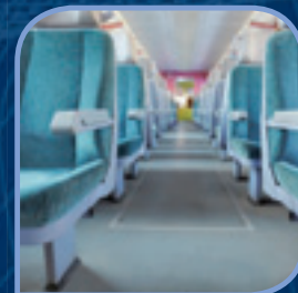
3 Floor coverings