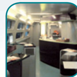
5 Kitchen and sanitary blocks