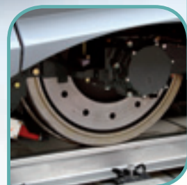
6 Brake system