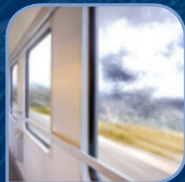
3 5 Window