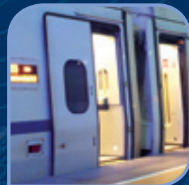
3 Outer/inner door