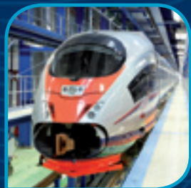
2 Carriage structure