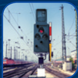
1 Trackside traffic control box Signal lights box