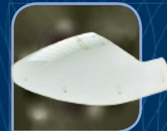
3 Air dam