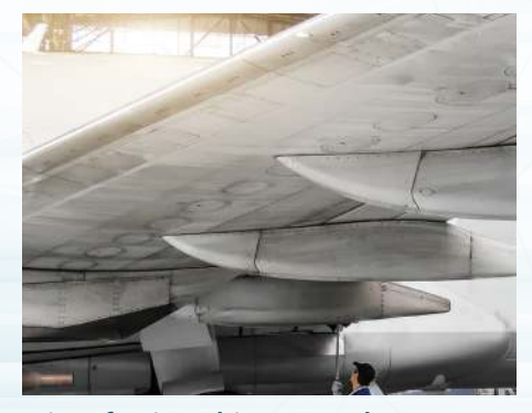
Aircraft Wing Ultimate Load Test