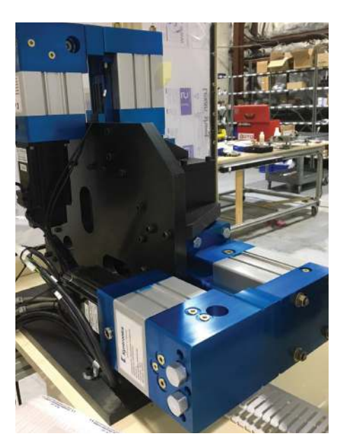
Kyntronics EHA's installed on a production valve pressure test system.