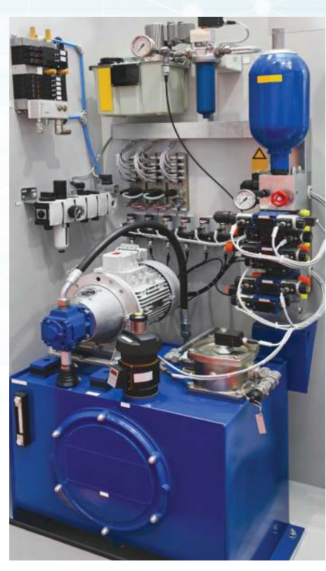
Central hydraulic systems are costly, expensive to operate, and have a large footprint.

Test cell time is a premium and down time can be quite costly. Actuator systems need to be robust to prevent failure during testing and have intelligent design to reduce maintenance and upkeep.