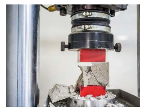
Material Fatique Testing